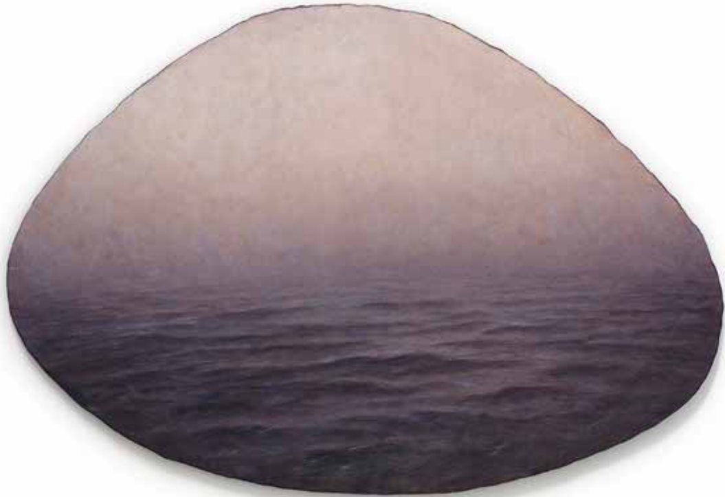
Mind's Eye , oil on hand beaten steel, approx. 25 x 36 cm, $1,700 - SOLD