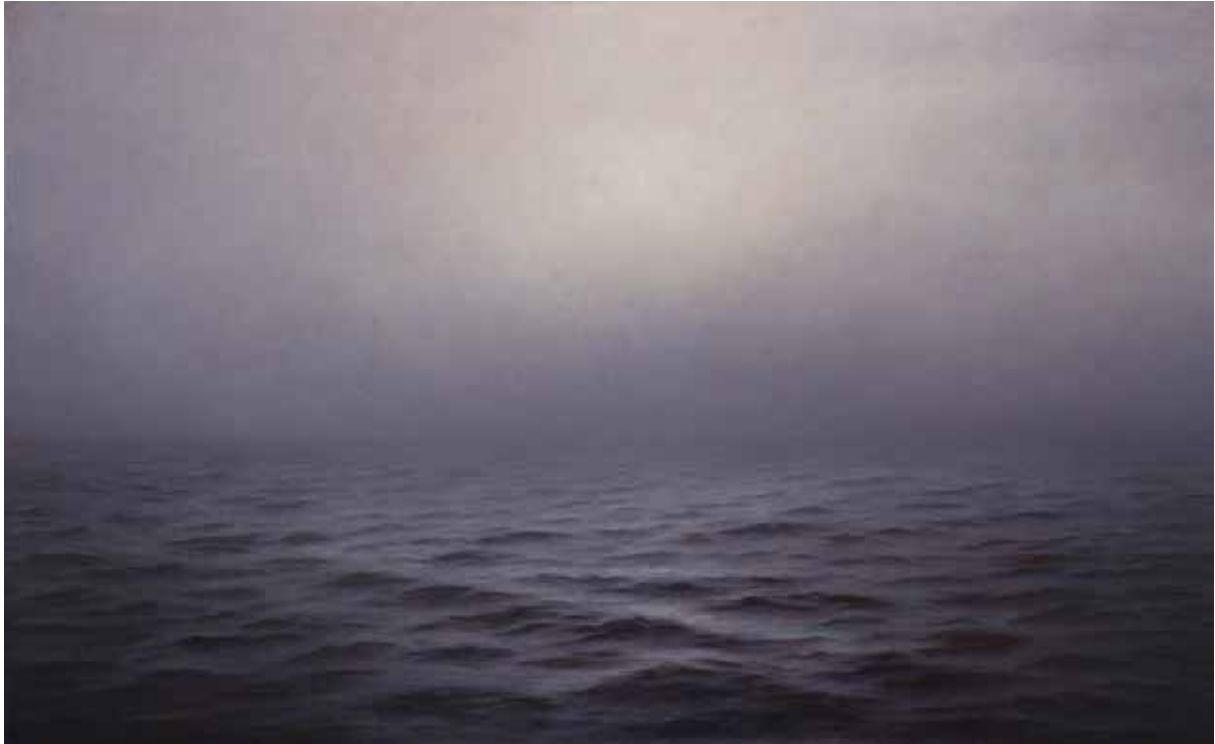
Crossing , oil on linen, 122 x 198 cm, $12,000 - SOLD