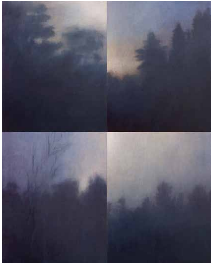
Lagoon Trees , oil on board, 50.5 x 40.5 cm, $2,800