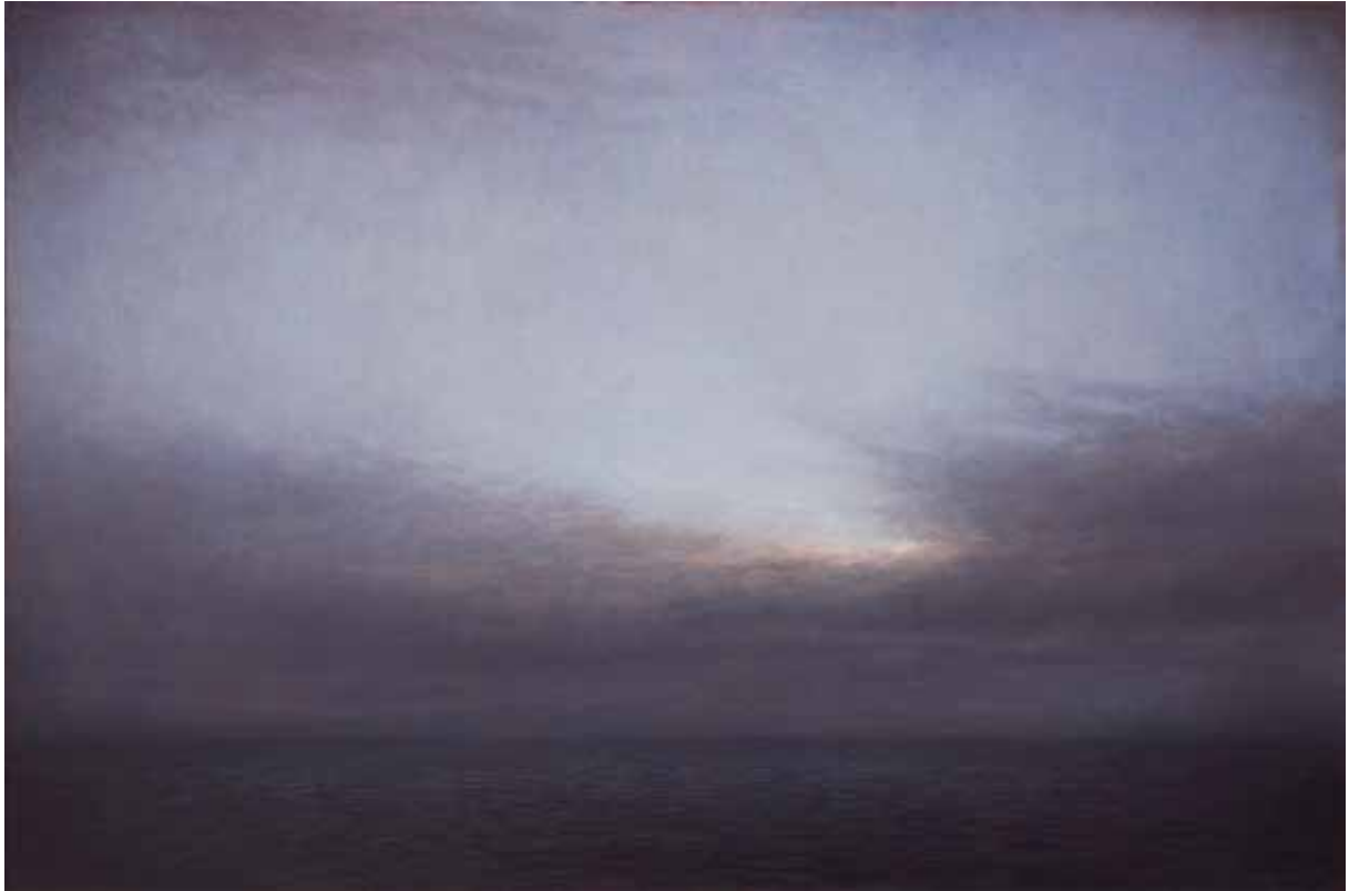
Lasting , oil on linen, 82 x 122 cm, $7,500