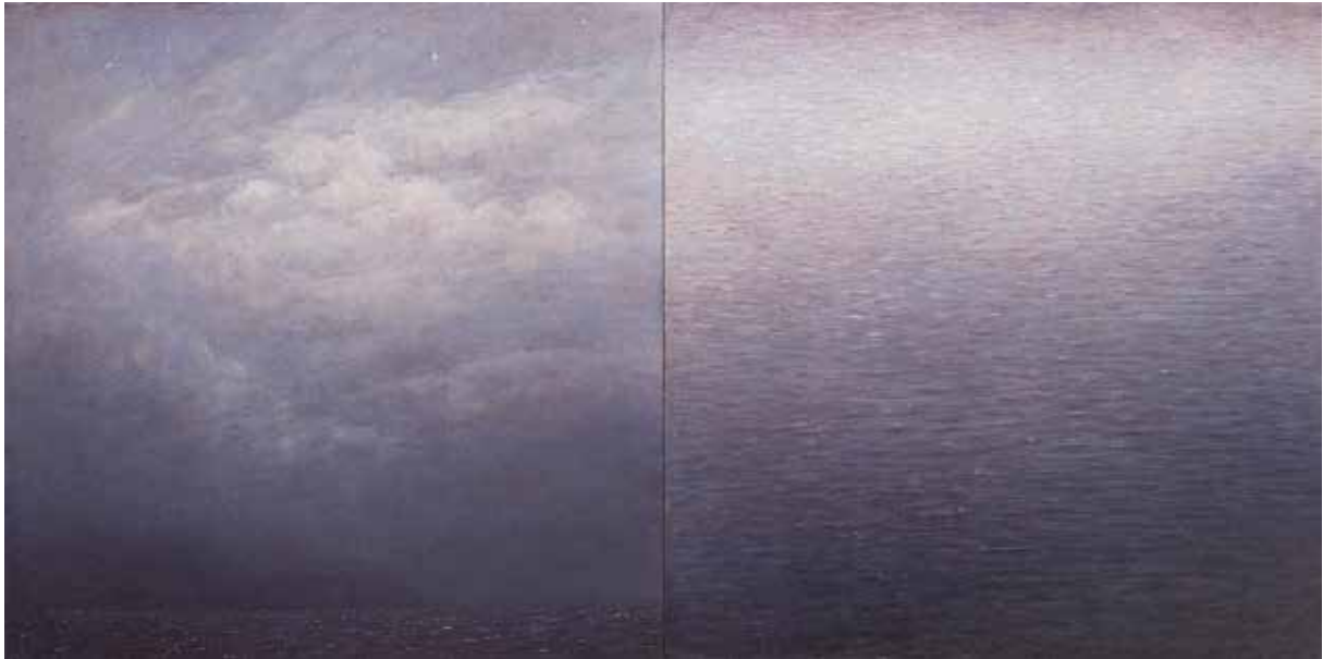
Echo (In the Night) I , oil on board, 15 x 30 cm, $1,500 - SOLD