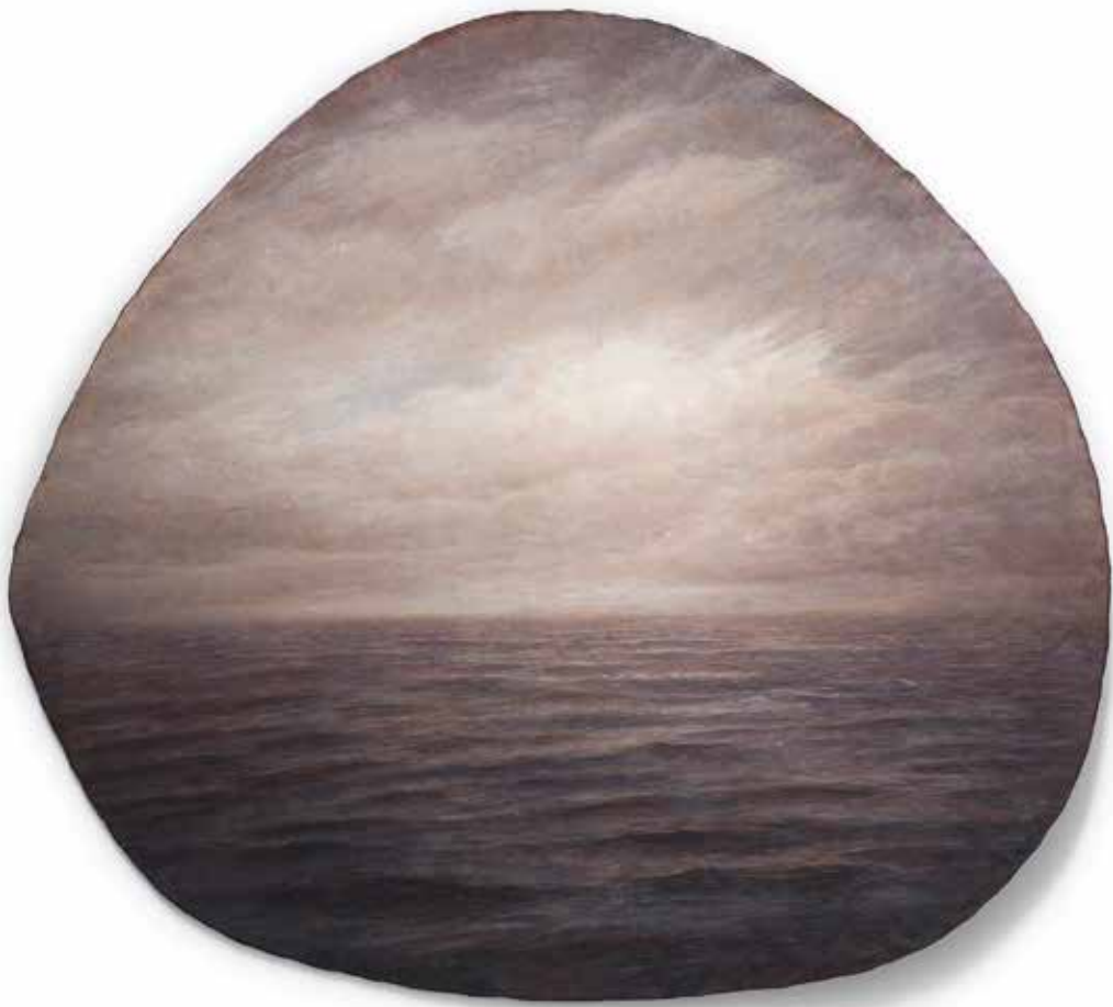
Awoke , oil on hand beaten steel, approx. 32.5 x 36.5 cm, $1,700 - SOLD