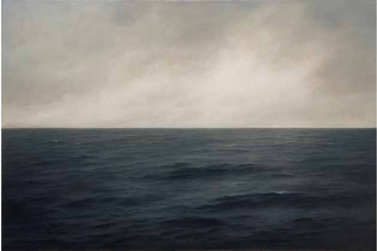
Looking for Land , oil on linen, 112 x 168 cm, $9,500 - SOLD