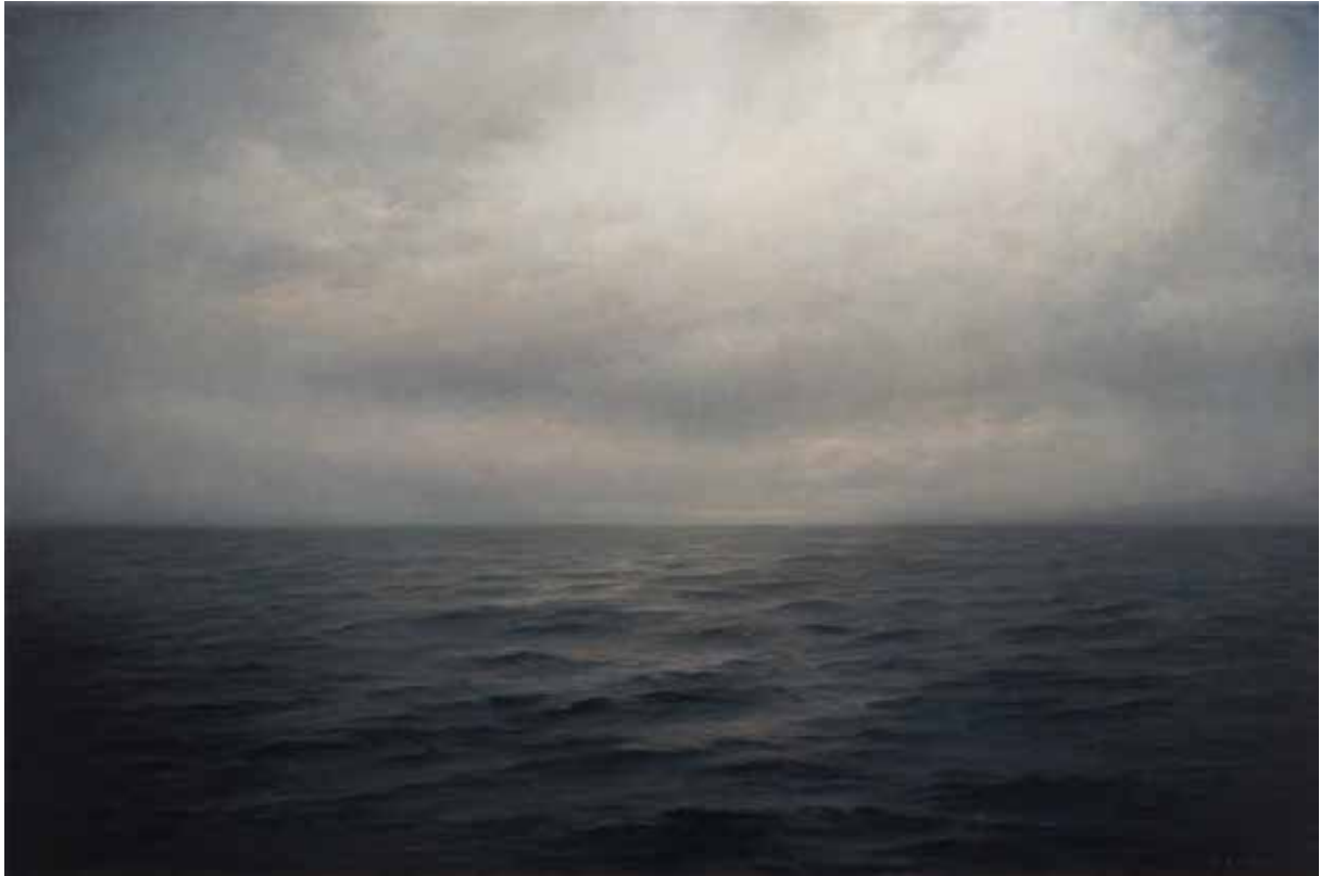
Return , oil on linen, 82 x 122 cm, $7,500 - SOLD