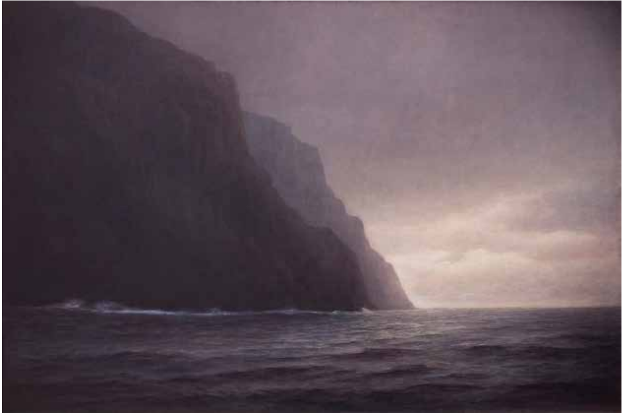
Passing , oil on linen, 82 x 122 cm, $7,500 - SOLD