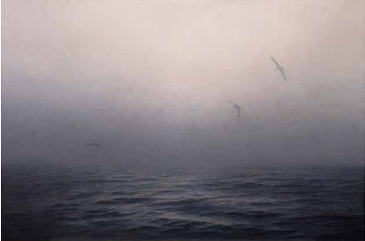
In Time Between , oil on linen, 112 x 168 cm, $9,500