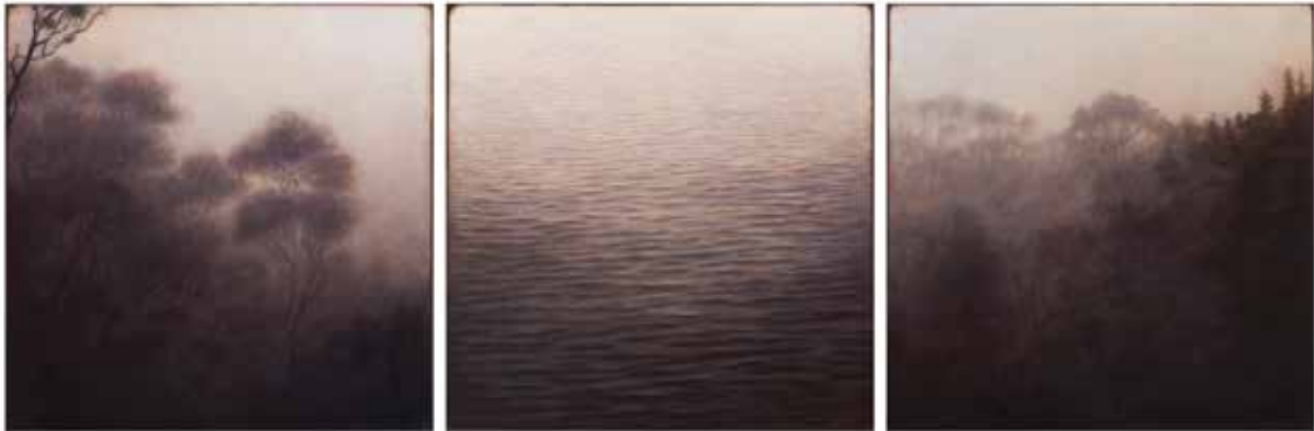
Cloudy Bay Lagoon , oil on linen (triptych), 61 x 183 cm overall; 61 x 61 cm each, $7,900 - SOLD