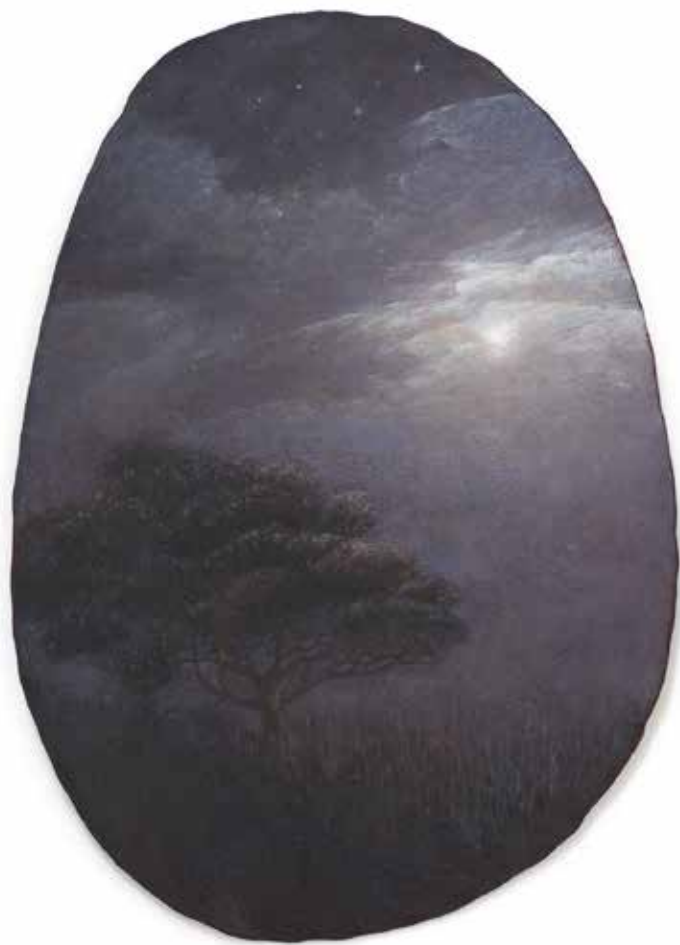
Wait , oil on hand beaten steel, approx. 25 x 17 cm, $1,500