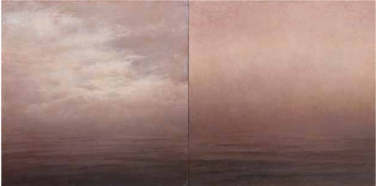
There and Not There I , oil on board, 15 x 30 cm, $1,500 - SOLD