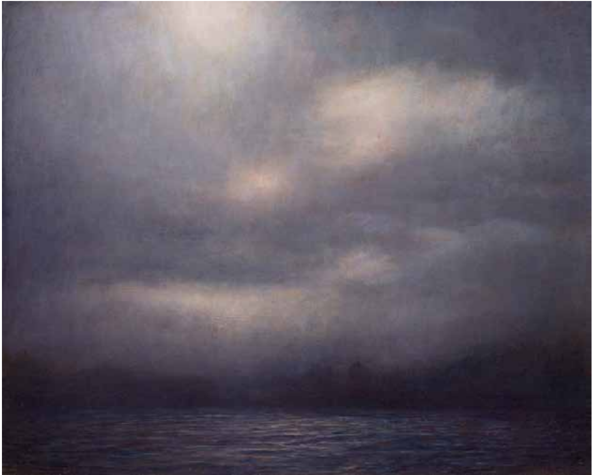
Longing III , oil on board, 20.5 x 25.5 cm, $1,500 - SOLD