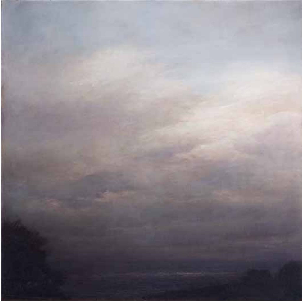
Lighthouse Walk , oil on linen, 56 x 56 cm, $ 3,500