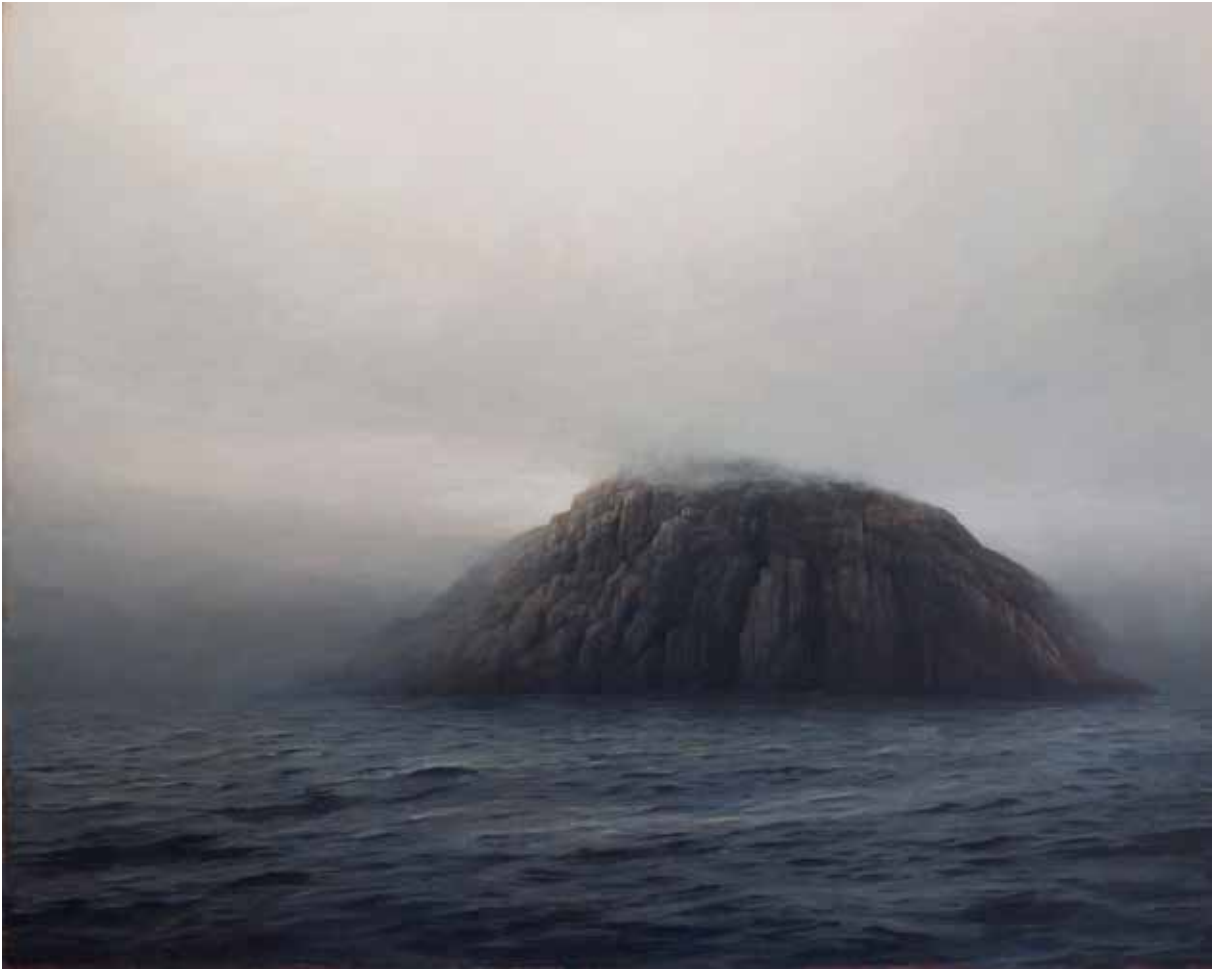
Looking Back , oil on linen, 122 x 152 cm, $9,500 - SOLD