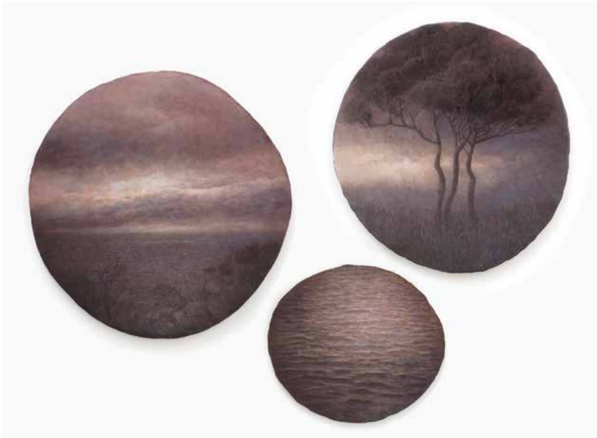
Moments , oil on hand beaten steel (triptych), approx. 47 x 49 cm, $2,800