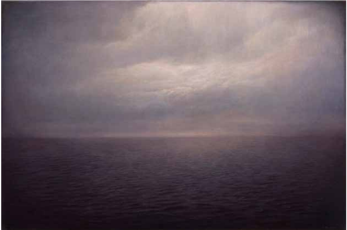
Envisage , oil on linen, 82 x 122 cm, $7,500 - SOLD