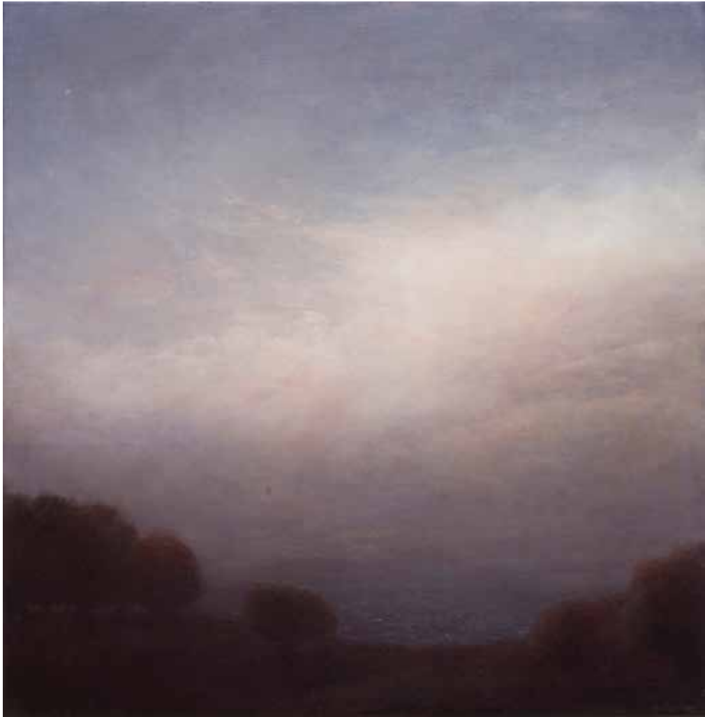
Lure , oil on linen, 61 x 61 cm, $3,500