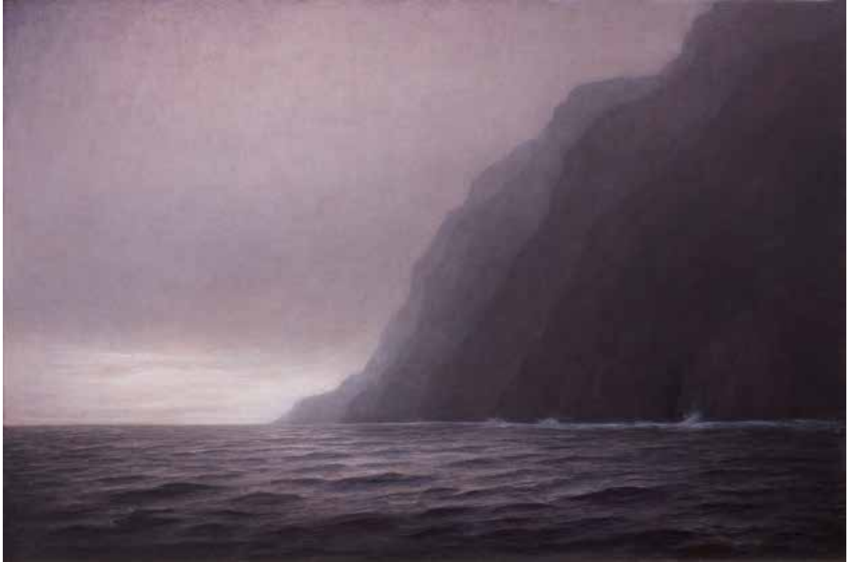
Landfall , oil on linen, 82 x 122 cm, $7,500