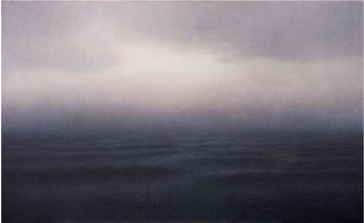
In Rain , oil on linen, 122 x 198 cm, $12,000