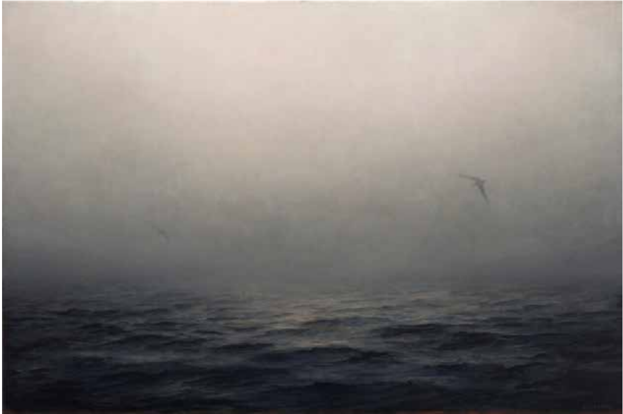
Calling , oil on linen, 82 x 122 cm, $7,500