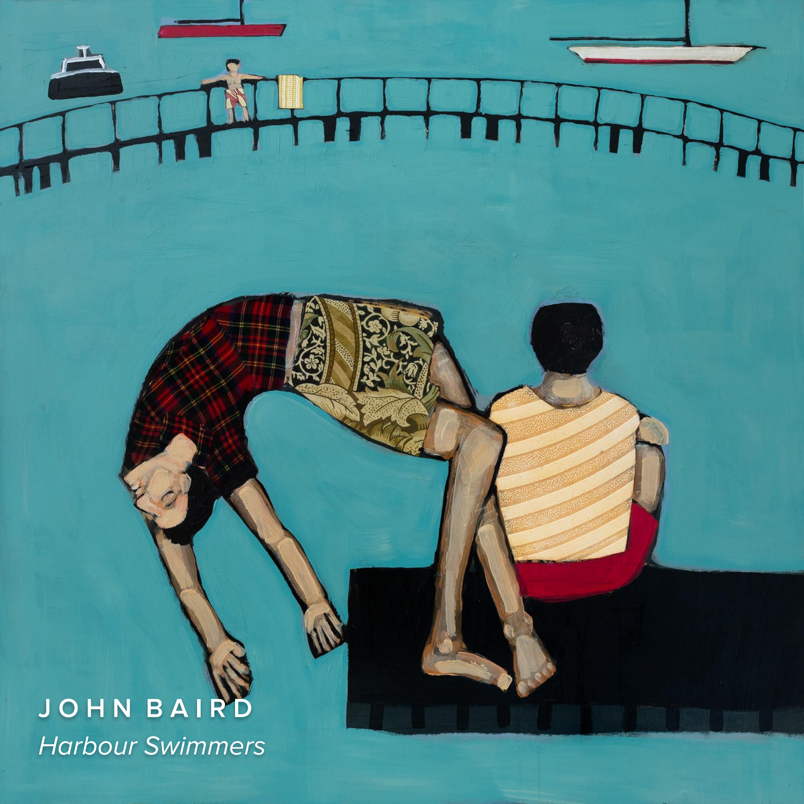
JOHN BAIRD Harbour Swimmers