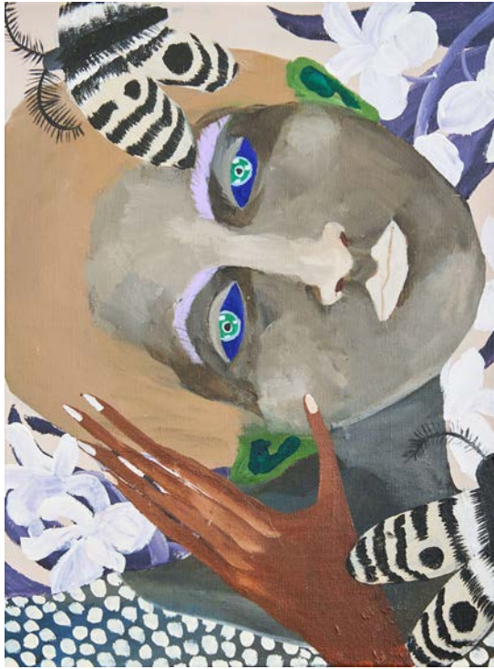
(Bottom Right) Songs of absence XI , acrylic on linen, 43 x 33 cm (framed), $3,200