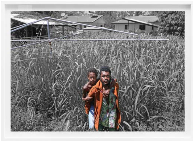
A Bed No-more (ed. of 5) photographic print on 310gsm cotton rag art paper 82 x 116 cm (framed) $5,700