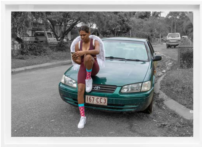
Angel Wings (ed. of 5) photographic print on 310gsm cotton rag art paper 82 x 116 cm (framed) $5,700