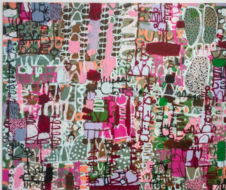
NAOMI HOBSON Language of the Land