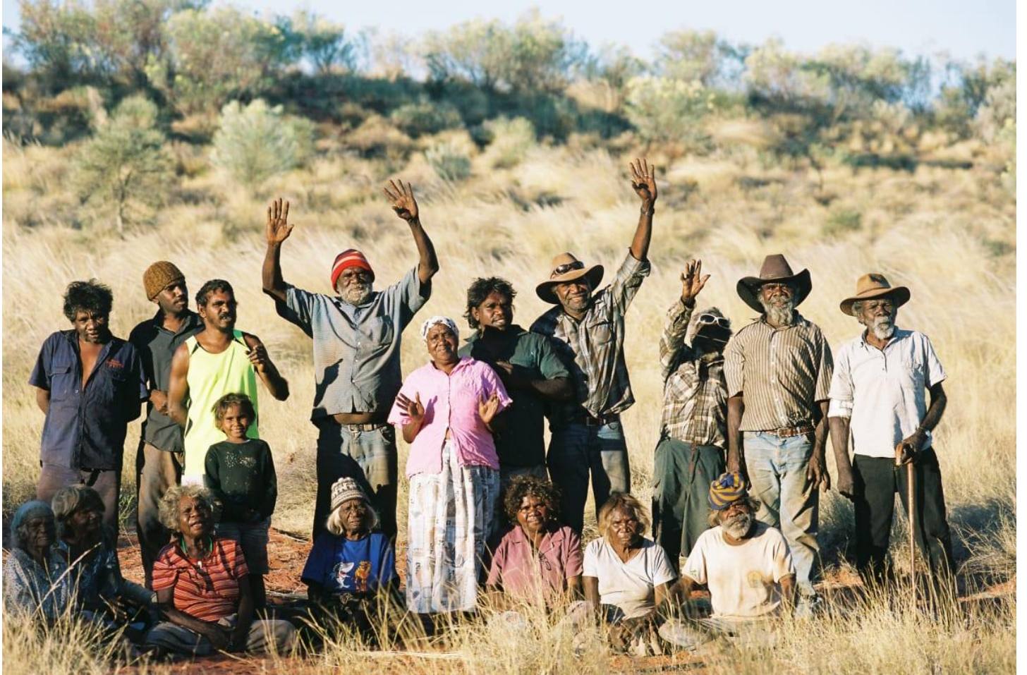
Yulparija on Country