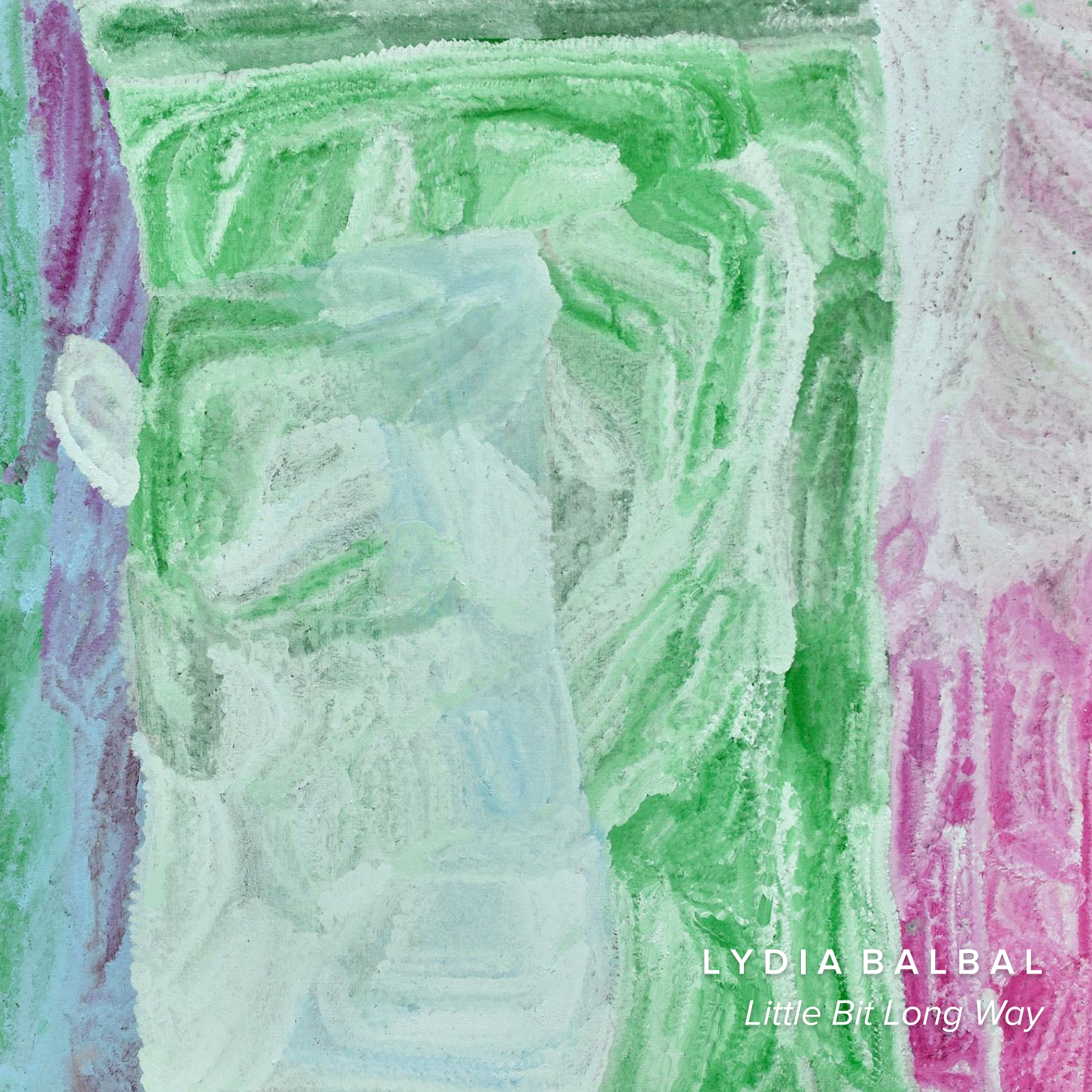
LYDIA BALBAL Little Bit Long Way