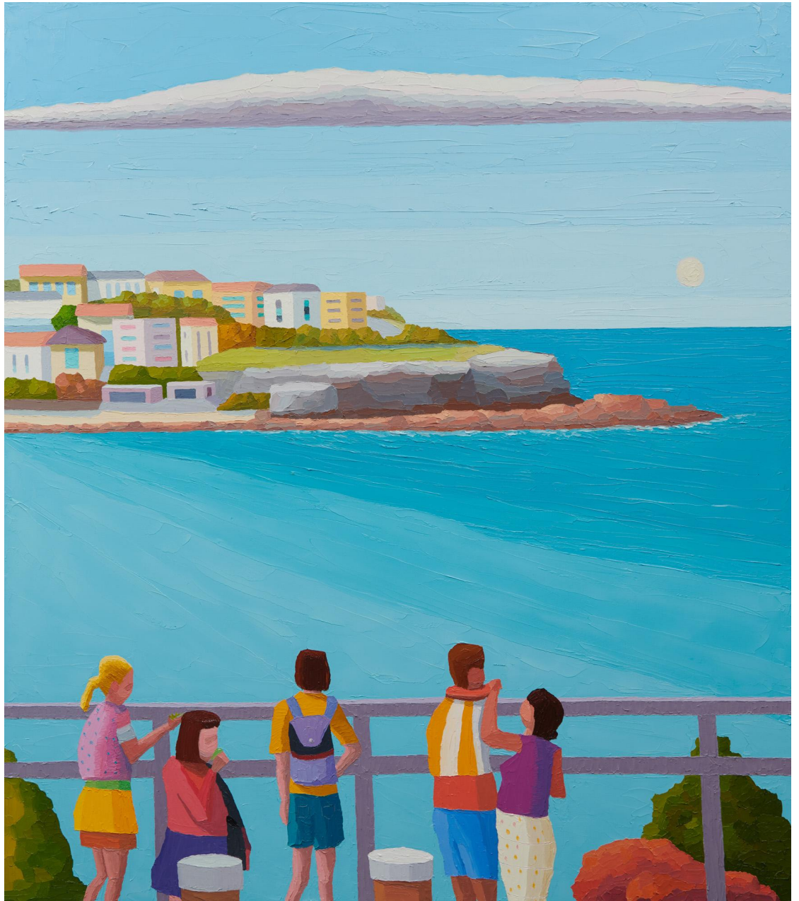
Down to Paradise oil on linen 122 x 107 cm $21,000

Everyone wants a selfie at Bondi, but they seem to forget to look without a lens or a device.