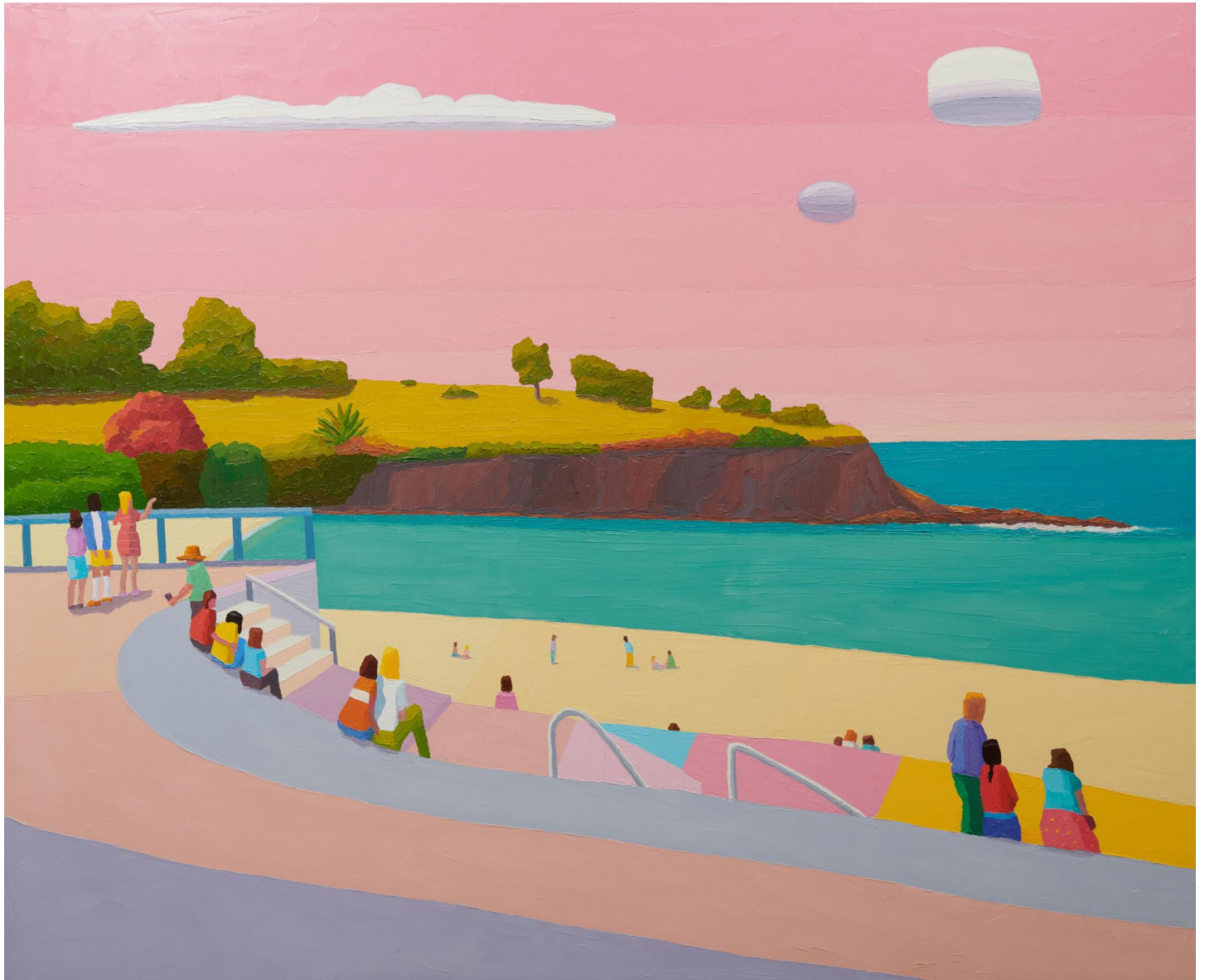
Walking Through oil on linen 137 x 167 cm $30,000

Coogee, people watching, live music and a long way home.