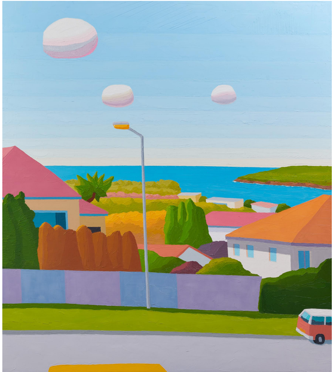
Riding Home oil on linen 137 x 122 cm $26,000

This is about the feeling of both looking out a window at a passing landscape from a moving vehicle and remembering what it was like riding home before dark. Somewhere between Bondi and Maroubra.