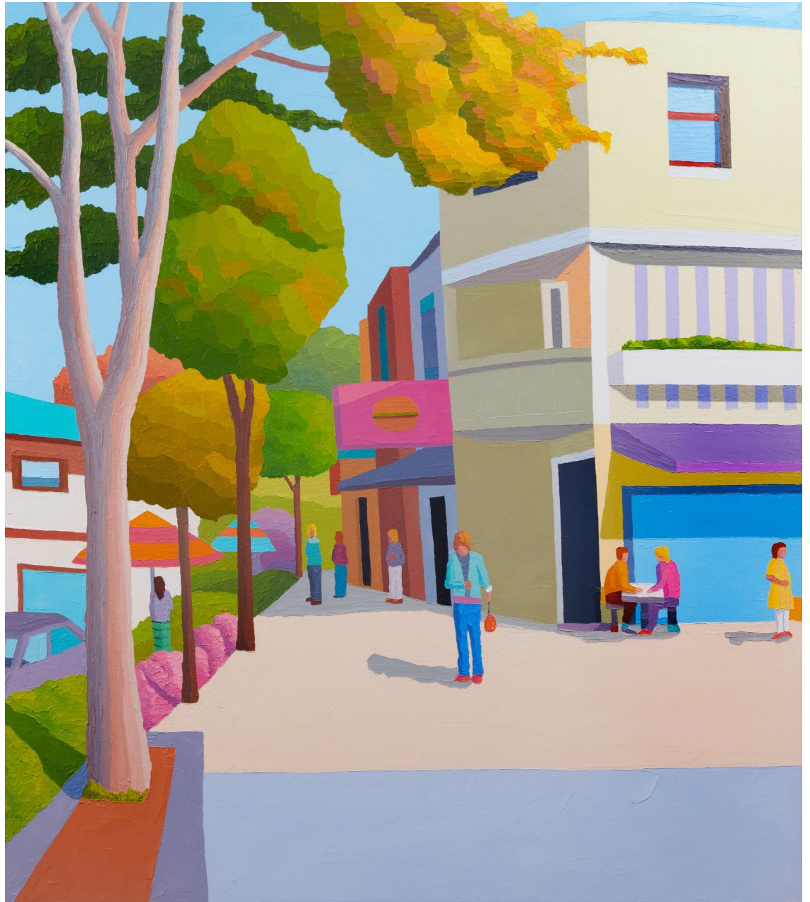
Younger Days oil on linen 137 x 122 cm $26,000

From around Surry Hills. The food smells, and terrace houses hark back to thinner waistlines and the ability to survive a hangover.