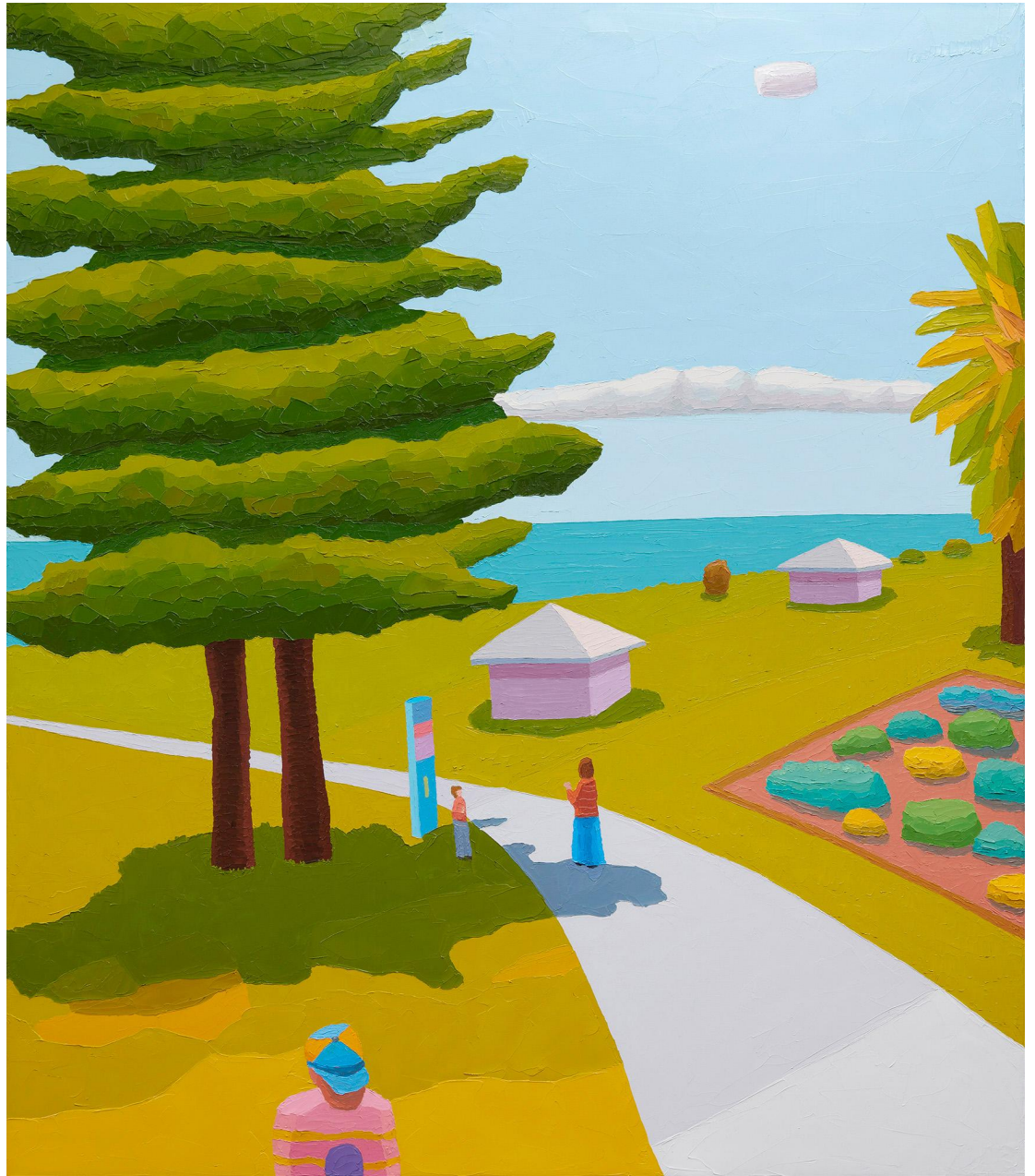
Wrapped Up oil on linen 122 x 107 cm $21,000

This is from around Bronte Beach, and I was thinking about turning public spaces everywhere into functional vegetable patches.