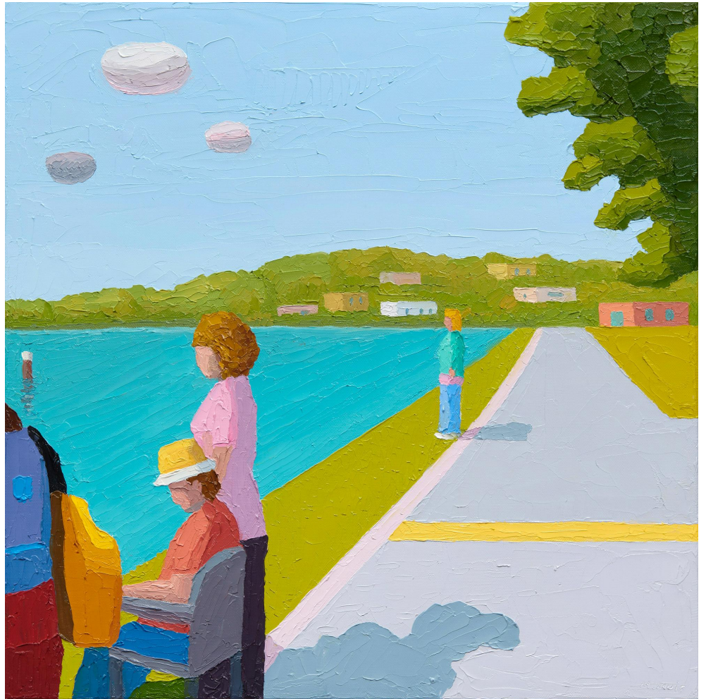
Southern Sky oil on linen 43.5 x 43.5 cm (framed) $5,500