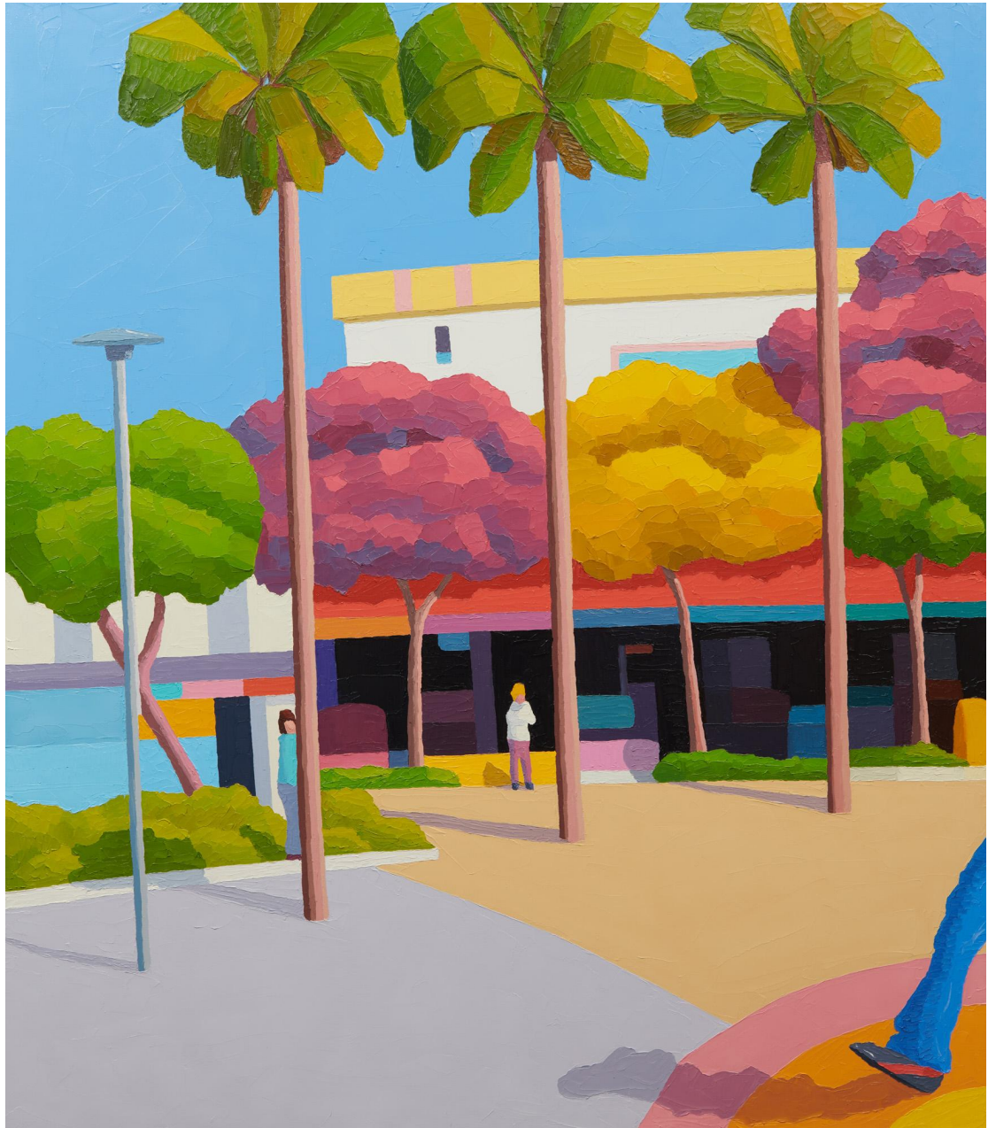
Crystal Light oil on linen 122 x 107 cm $21,000

Crystal Light, is around Double Bay. I recall a not-so-chic moment as my driver managed to park half on the footpath.