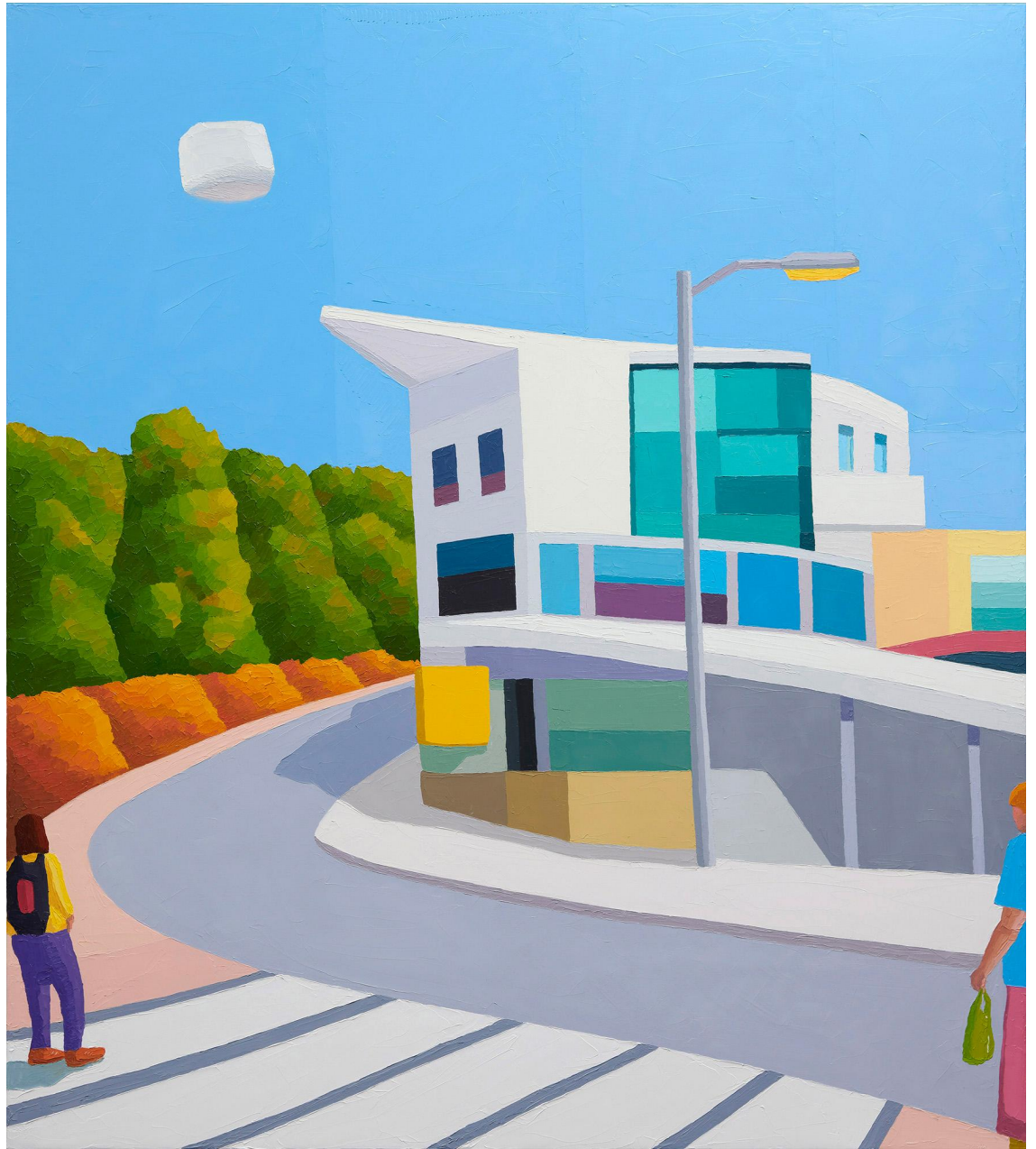
A New World oil on linen 137 x 122 cm $26,000

Like most aspects of my show, it's about the present, the past and how we fit into the context of our environment. As the mind wanders about what the future holds, I find myself around the streets behind the Watsons Bay ferry.